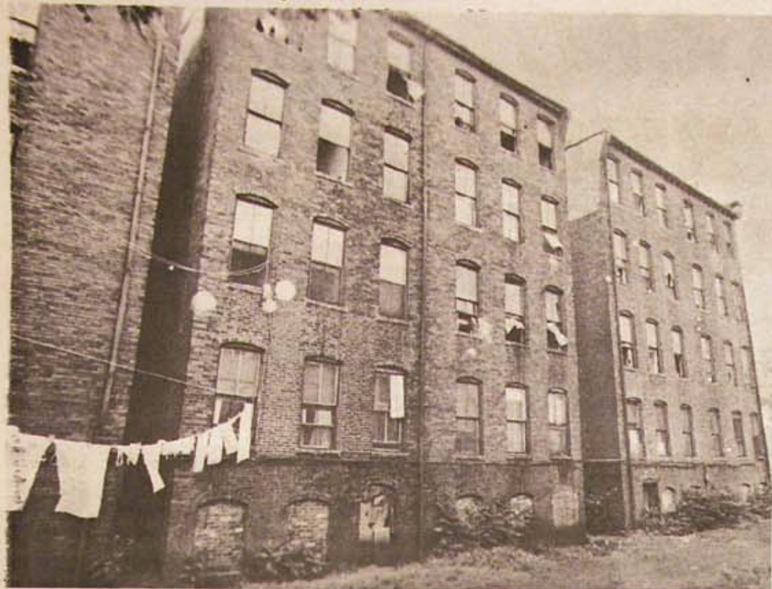
Maurice Gordon owns 14,000 such apartment buildings.