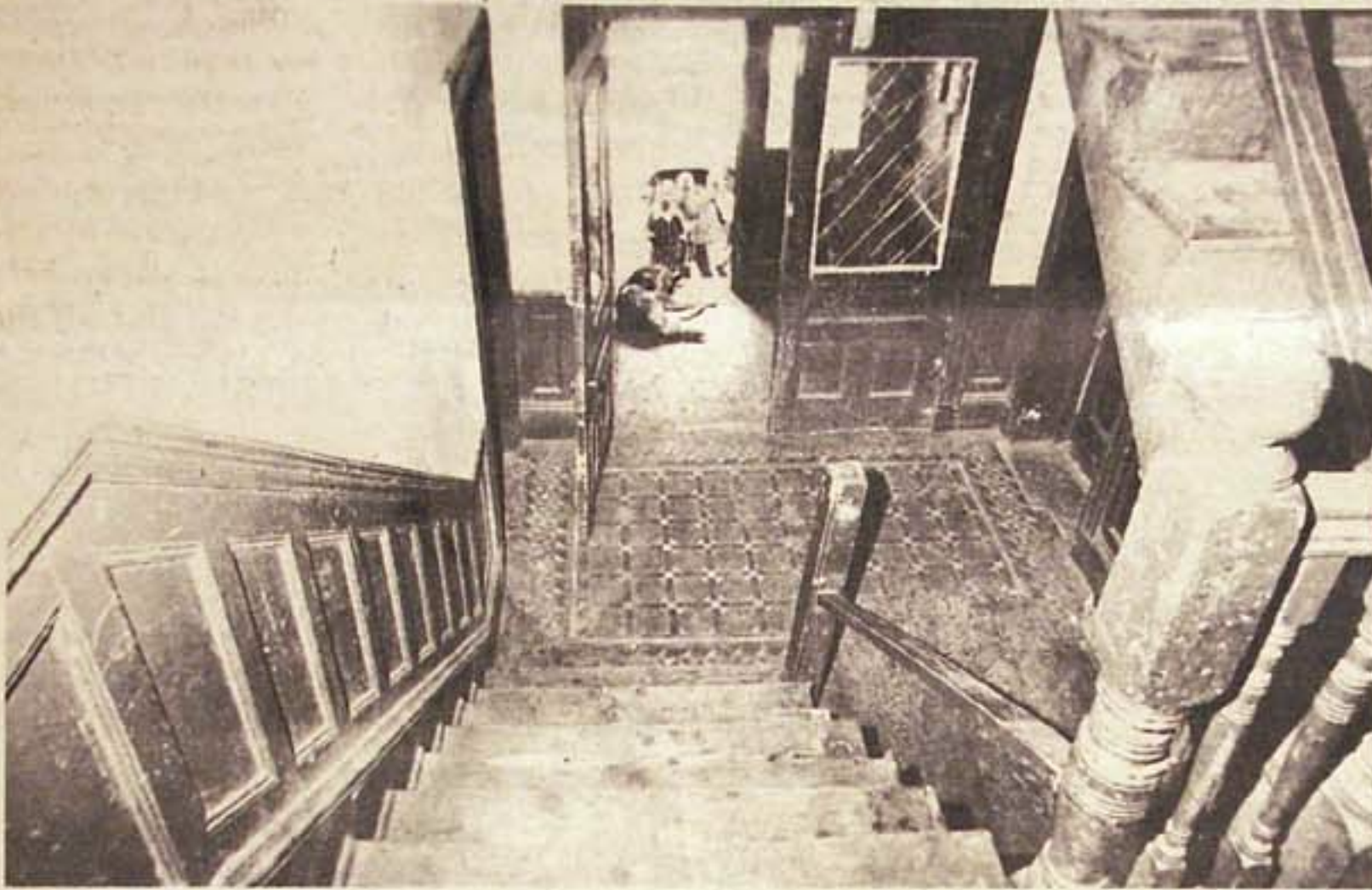
Maurice Gordon's children don't have to play on these steps.