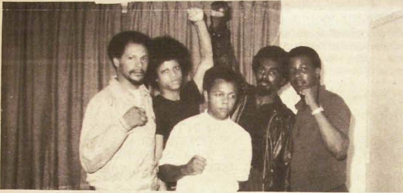
THE RICHMOND, VIRGINIA FIVE