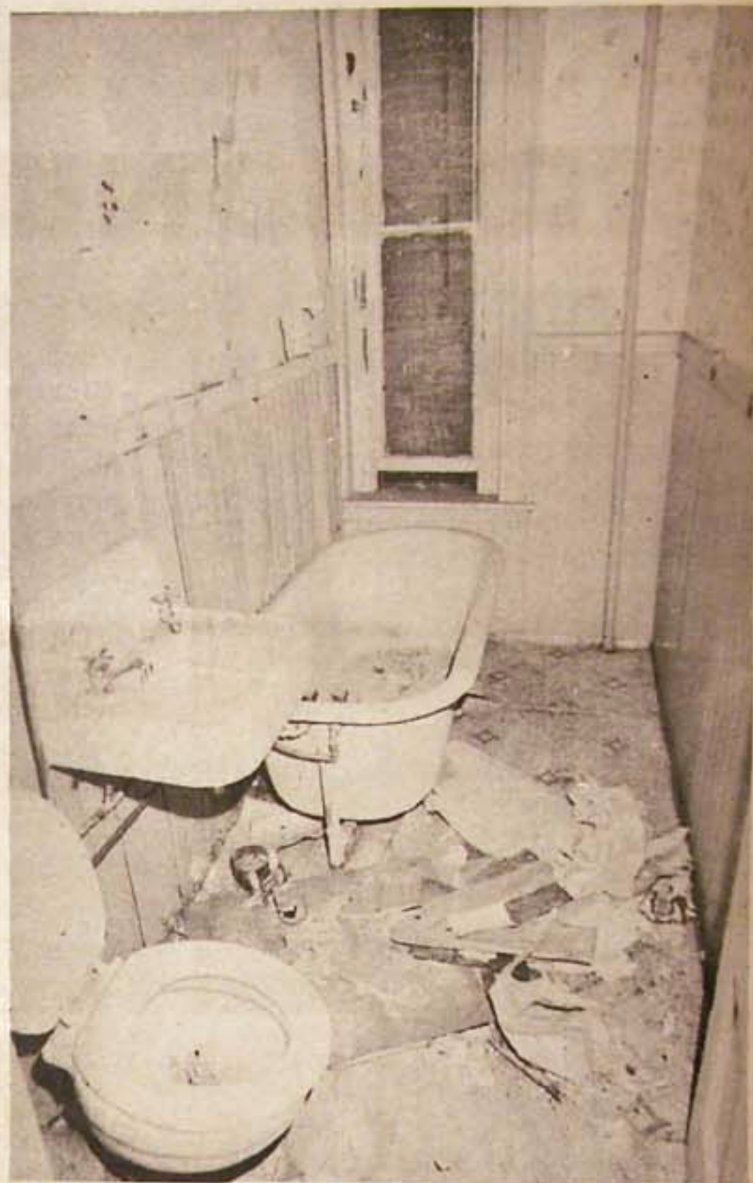
This apartment is for rent from Gordon and Sons.

The cornerstone and foundation for the system of American corporate capitalism has been in the relationship of the individual to property. All laws seem to derive their meaning based on that relationship. From the very be-