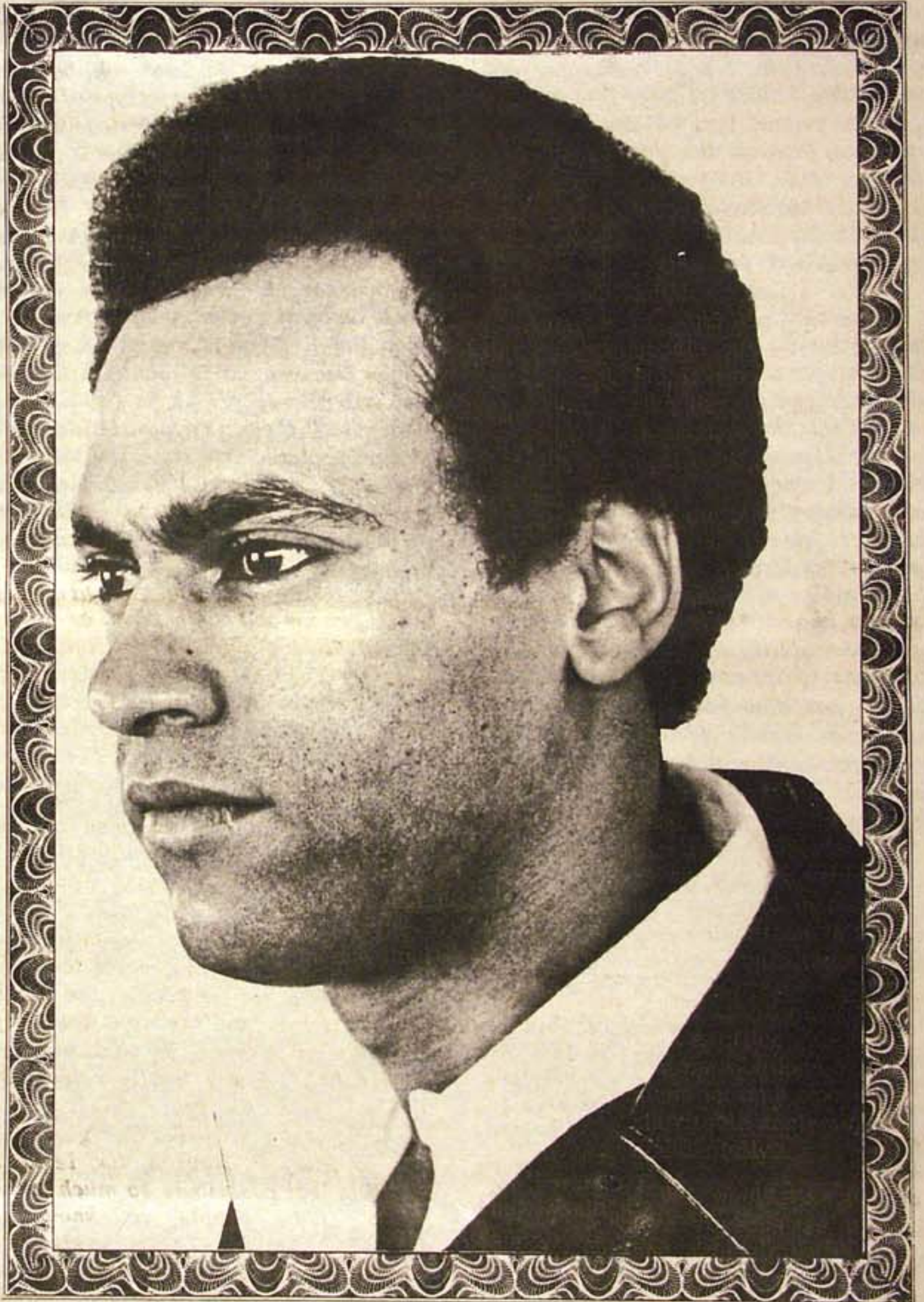
THE MINISTER OF DEFENSE